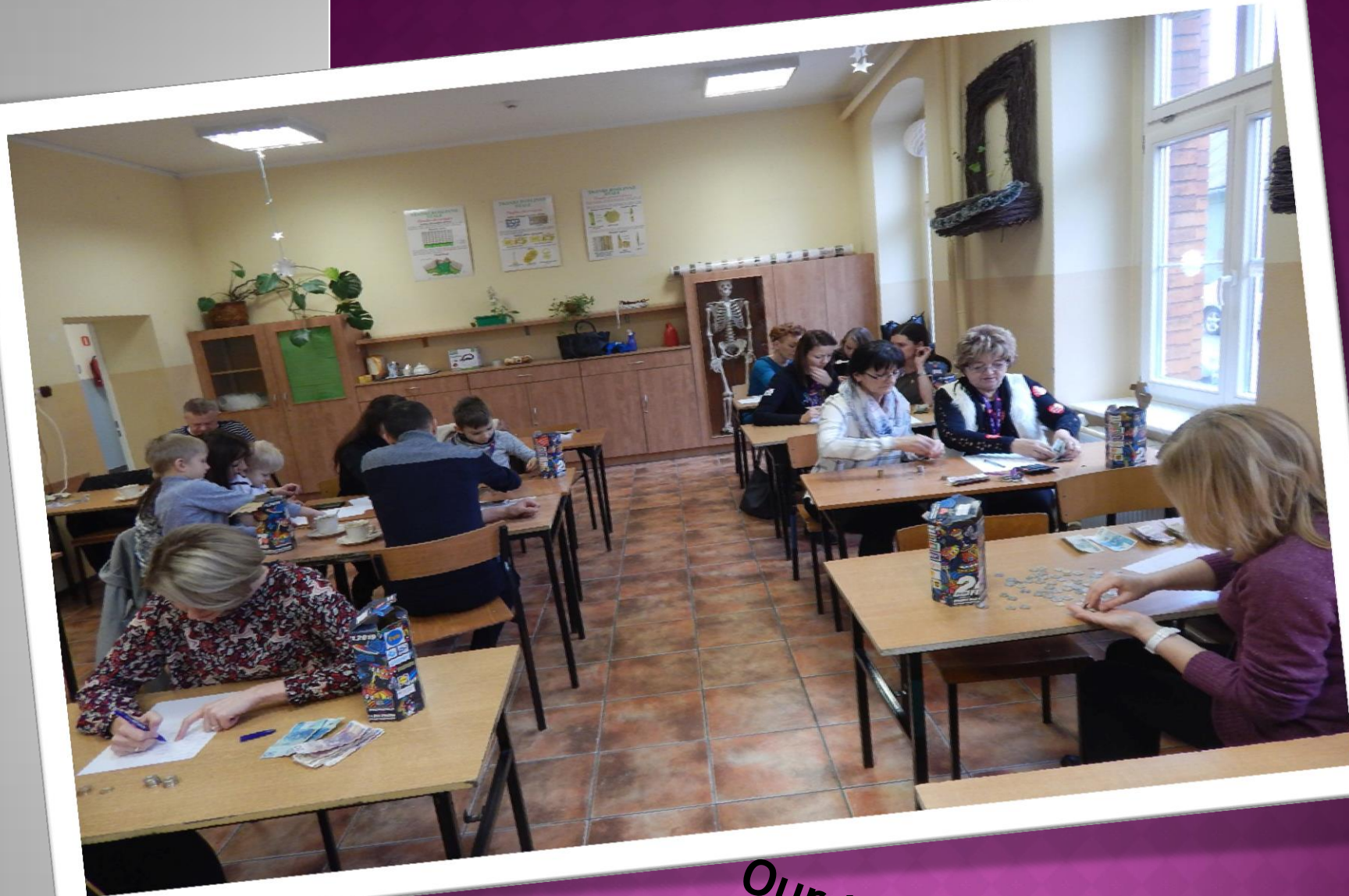
Our teachers counting money