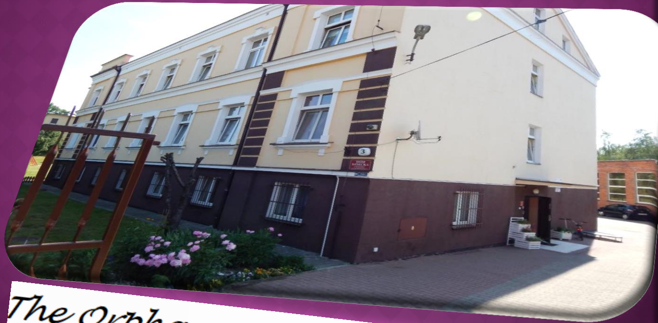
The Orphanage in Kalisz